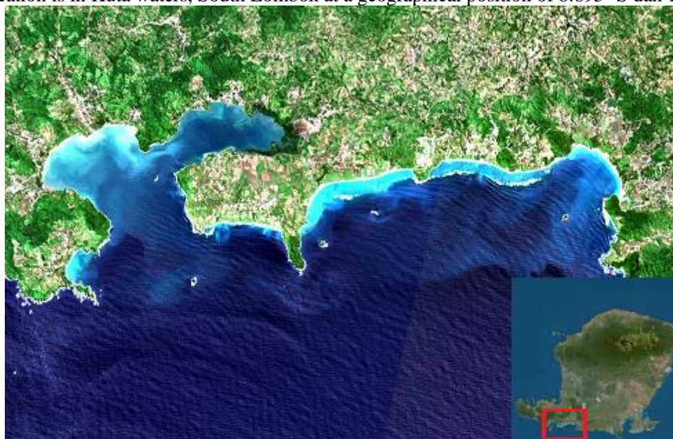
Figure 1. Research location

The research location is in Kuta waters, South Lombok at a geographical position of 8.895° S dan 116.306° E.