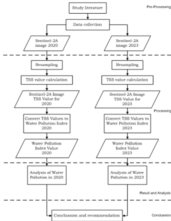
Figure 2. Stage of image data processing

The algorithms used in generating the TSS are the NDTI, NDWI algorithms. Normalized difference water index (NDWI) is a satellite based index used for mapping and detecting the surface water bodies. Water absorbs electromagnetic radiation in visible to infrared spectrum, that is why Green and Near Infrared bands are used to detect the water bodies. In the current study, band 3 (green) and band 8 (NIR) of Sentinel-2 are used for generating NDWI raster (Gao, 2996; Xu, 2006; Brockmann, 2016):